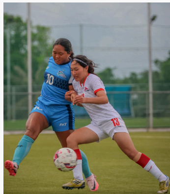
THREE NATIONS CUP JULY 2024