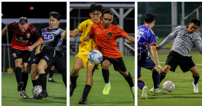
MARIANAS SOCCER LEAGUE DIVISION 1 | DIVISION 2