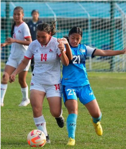
EAFF U15 WOMEN'S CHAMPIONSHIP 2024 AUGUST 15-23, 2024 | DALIAN, CHINA PR