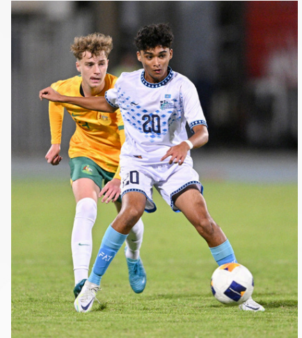
AFC U17 ASIAN CUP 2025 QUALIFIERS OCTOBER 23-27, 2024 | SALMIYA, KUWAIT

Our Men's and Women's National Teams proudly represented the NMI in multiple international competitions organized by the East Asian Football Federation and the Asian Football Confederation, demonstrating both skill and determination on the field. These tournaments provided valuable exposure and experience for our young athletes, allowing them to test their abilities against world-class opponents.