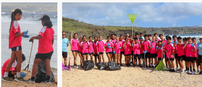
JUNIOR NATIONAL ACADEMY TRAINING CAMP 2025 | BEACH CLEAN-UP

Our Junior National Academy (Under 12), also demonstrated our commitment to environmental stewardship through a two-day beach clean-up for Micro Beach and Marine Beach. This activity, held as a part of their training camp, encouraged our young players to take care of our environment. Together, they collected over 10 bags of trash each day, making the beaches cleaner and safer for everyone.