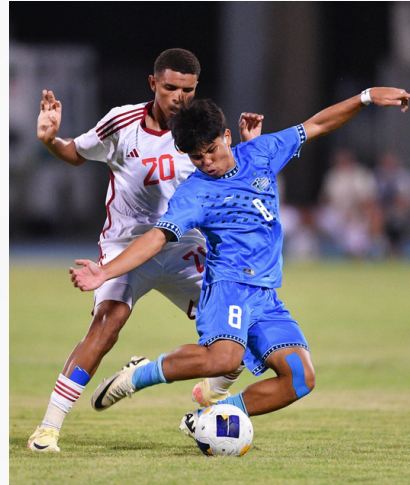
AFC U20 ASIAN CUP 2025 QUALIFIERS SEPTEMBER 20-27, 2024 | SALMIYA, KUWAIT