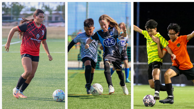
TAKECARE YOUTH SOCCER LEAGUE NON-COMPETITIVE: U6, U10, U12 COED | COMPETITIVE: U12B, U14G, U14B, U17G, U17B