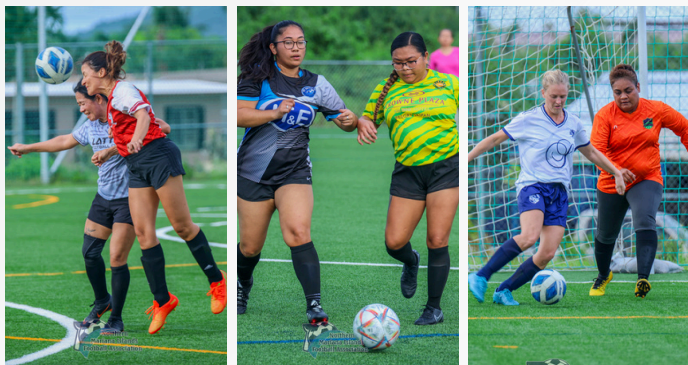
DOVE WOMEN'S LEAGUE A DIVISION | B DIVISION | MASTER'S DIVISION

In the 2024–2025 season, the NMIFA's domestic leagues delivered a full calendar of matches, showcasing the depth of local talent and reinforcing our commitment to developing football from the grassroots to elite levels.