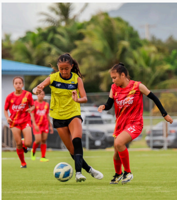
LPK CUP JULY 2024

We also had the privilege of hosting training camps, giving our national teams the necessary preparation and conditioning to elevate their performance. These camps featured intensive training sessions, tactical workshops, and friendly matches that allowed players to refine their skills and team dynamics. The opportunity to host international teams from Guam, Hong Kong, Philippines, and Mongolia benefited our players and strengthened our reputation in our regional football community.