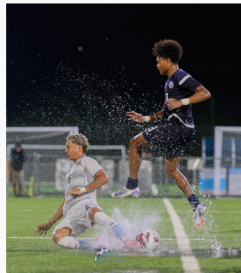
MARIANAS CUP AUGUST 2024